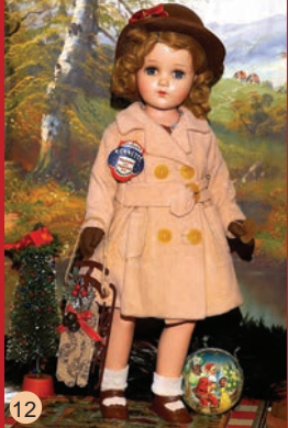
12) Mint & Pretty 21" Nanette - early compo, clear eyes, 2-Tags, no craze, Factory Clothes w Hat! $350