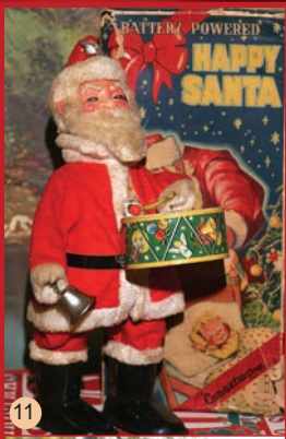
11) 1950'S Happy Santa in Box -11" fun holiday display toy in bright clean condition, cello face. $75