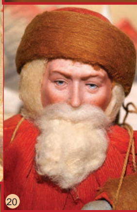
20) Rare Bisque Face Santa - Mint and Complete! see #8