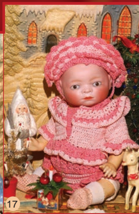
17) 12" First Edition Jointed Byelo - mint early socket head version, Big Eyes, on orig. sgnd. composition body in lively period crochet. Christmas Morning! $395