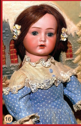
16) Vintage 16" K*R '117' Naughty - 'Mein Liebling' w. Orig. KR body, pretty period clothes, shoes & uncut wig. Plus, the 'Naughty' Working Eye Mechanism! $695